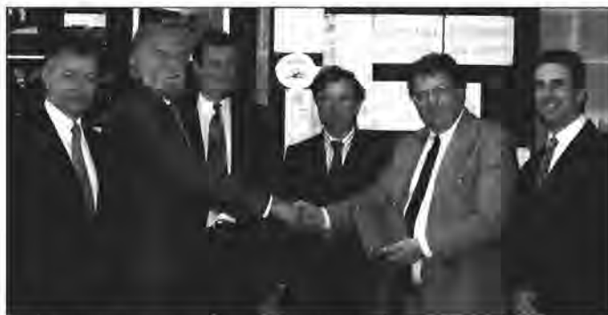
The presentation of the Foundation for Sport and the Arts Plaque at Cirencester Deer Park School